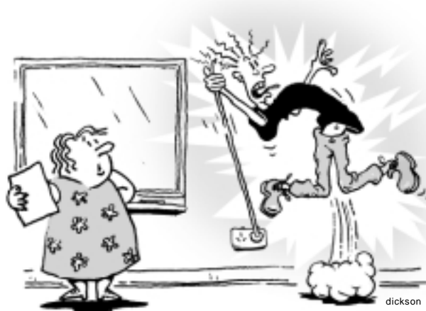
Relevant, student-centred, real-world learning activities—literacy in the electrical trades class