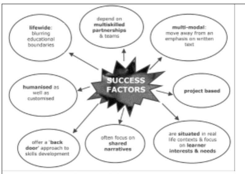
Figure 1: Common success factors in innovative program models

One of the most difficult tasks for teachers and trainers seems to be grappling with competency