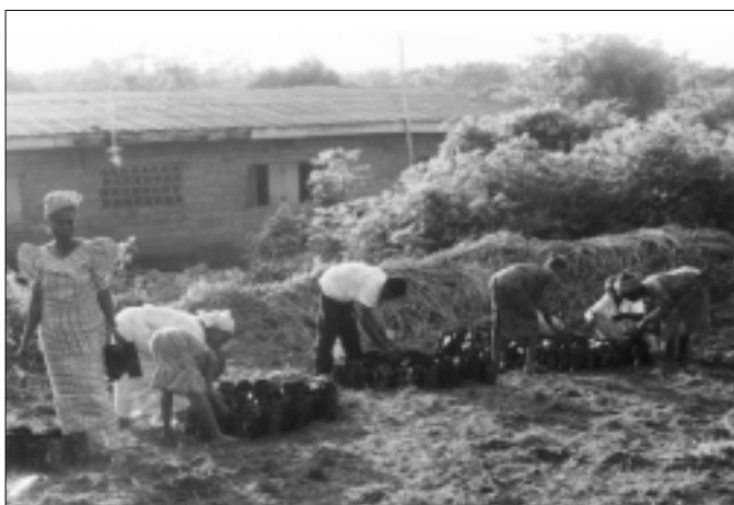
Literacy participants germinating sprouted palm kernels

The caterer brought the local measure called congo to indicate the level of zobo, and water. All the ingredients were washed and boiled. It was a participatory activity. The measuring and cooking were done in all the centres, so as to show correct procedure. Thereafter the economic, social and health advantages of zobo were discussed in the class.