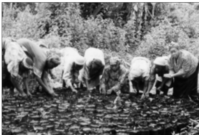
In three to six months the palm seedlings will be ready for sale at almost double the price of the initial cost.

deliberate. Adult education is for immediate utility. In addition to other drinks, zobo drink was made prominent. It was chilled and served to all present with the emphasis on the fact that the drink was locally brewed. Prominent personalities of Mamu responded to the invitation and speeches were made.